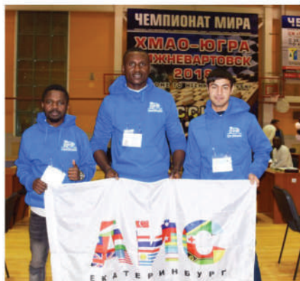
International Student Association