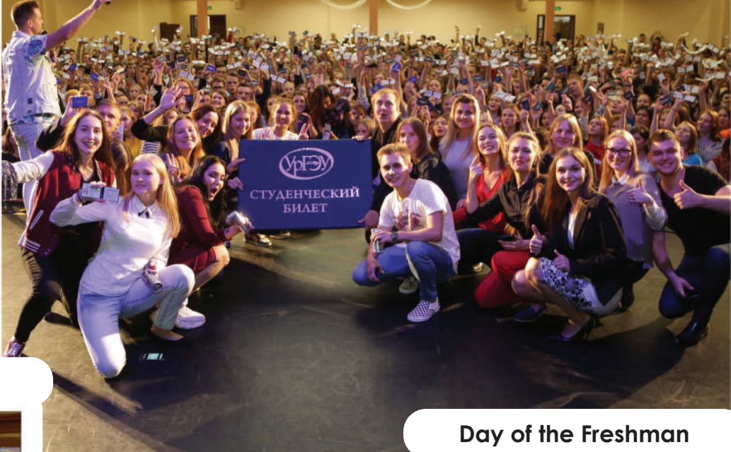
Day of the Freshman