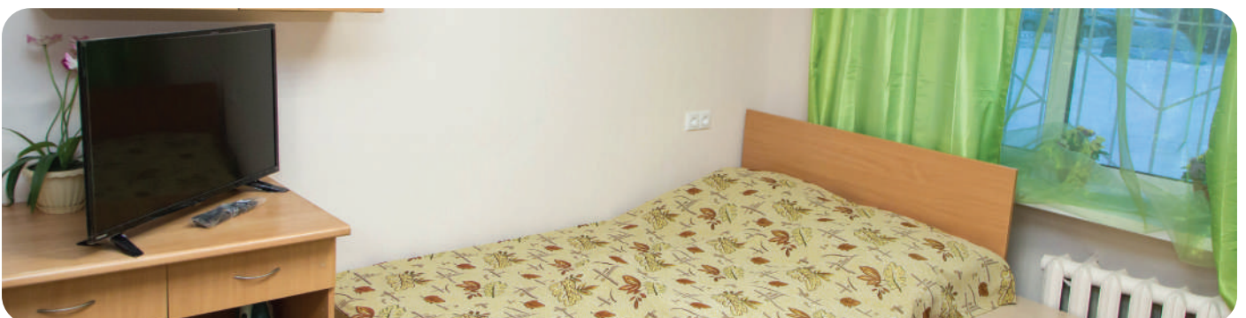
Rooms of the dormitory